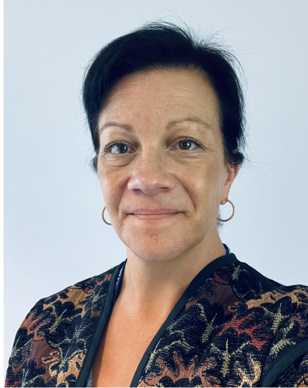
1 - Message from Emma Brown