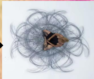
Whole body gestural drawing