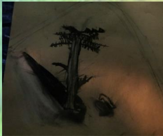
Exploring chiaroscuro with small objects